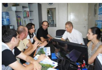
Meeting with environmental NGO in Cahul

administrations of three districts (Falesti, Glodeni, Cahul). The experts were informed about the agricultural practices and the measures undertaken by local administrations and envi-