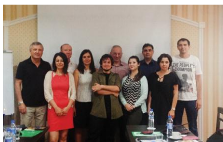
Participants of the third workshop in Chisinau

On the 28 th and 29 th of July 2014 in Chisinau, the NGO "ProRuralInvest" (PRI) Moldova hosted the 3 rd workshop in the framework of REPAIR the project. This meeting aim was to summarize the results of the 1st year of activities of each partner country focused on the project's objectives: strengthening partnership and cooperation in the Black Sea region and, by working together, coming up with solutions for common area problems and promoting the environmental sustainability.